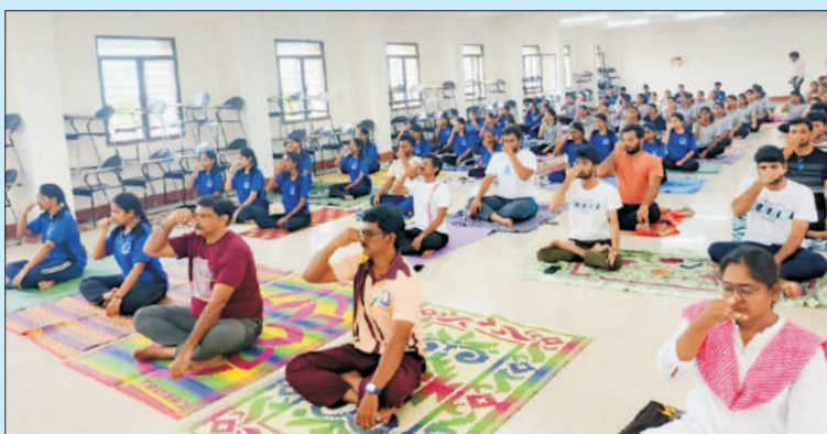
Yoga day Celebrations at CVSc, Proddatur