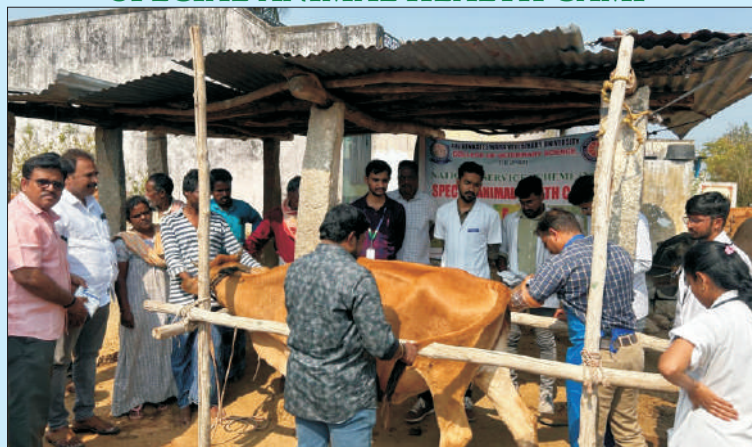
NSS Students of CVSc, Tirupati Conducting Special Animal Health camp