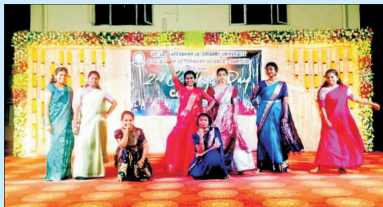
Cultural Programme by Students of CVSc, Garividi