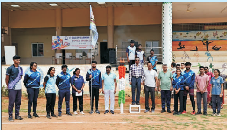
Inaugural function of Sports Day at NTR CVSc, Gannavaram