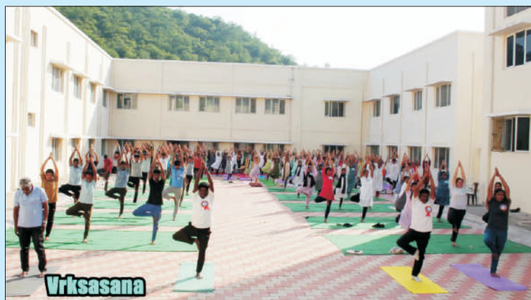
Yoga Day Celebrations at CVSc, Garividi