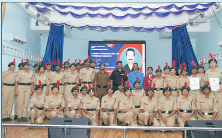
NCC Cadets of 2(A) R&V NCC Regiment, Tirupati Attending Career Orientation Programme