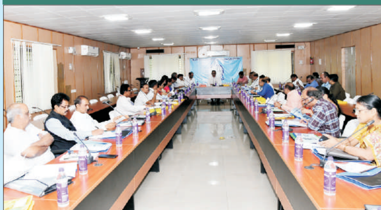
23 rd Academic Council Meeting