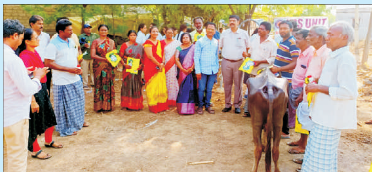
Distribution of Pamphlets during Animal Health Camp by NSS Students of CVSc, Proddatur

They provided clinical and supportive services, deworming camps for sheep and goat, fertility camps for cattle, minor surgeries like patellar desmotomy for cattle, distribution of mineral mixtures and essential drugs to some of the poor livestock owners and the farmers. On the last day the students were provided NSS completion certificates.