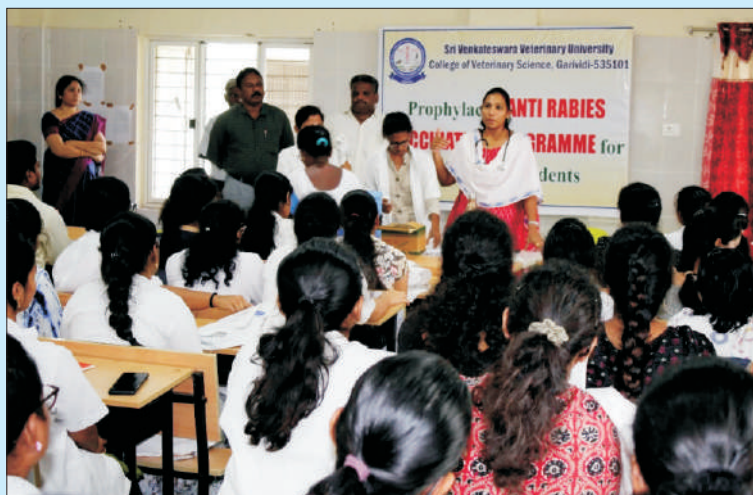
Faculty of CVSc, Garividi Creating Awareness against Rabies