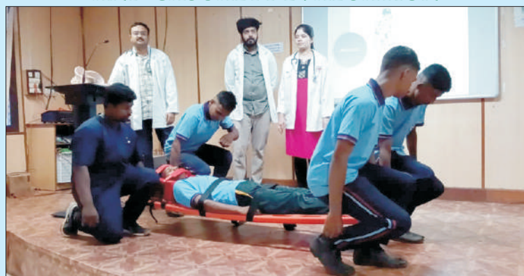
Practical Training on First Aid and Casualty Evaluation