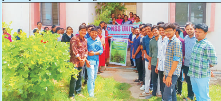
Tree Plantation in College Premises by NSS Volunteers at CVSc, Proddatur