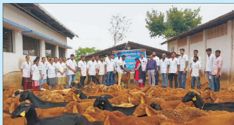
Deworming in Sheep and Goat by NSS Students of NTR CVSc, Gannavaram

NSS "Special Animal Health Camps" from 18.04.2025 to 24.04.2025 for the final year BVSc&AH students were organized by CVSc, Tirupati, NTR CVSc, Gannavaram and CVSc, Proddatur at six villages covering Gannavaram, Bapulapadu, Ungutur mandals and Proddatur, Mydukur, Chapadu, Rajupalem, VN Palli and Khajipet mandals, respectively.