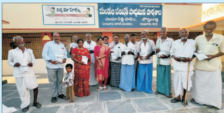
Trainees with Area-Specific Mineral Mixture Packets of SVVU