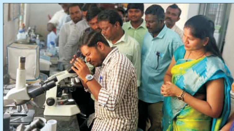
Demonstration of faecal sample analysis