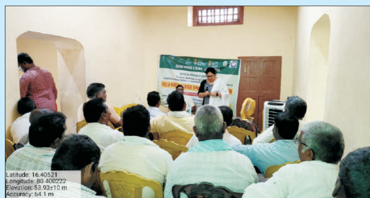
Training for Cotton Farmers at Ponnekallu Village