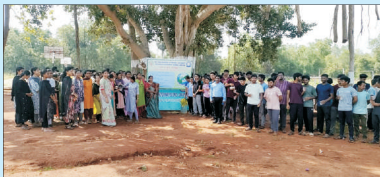
Creating Awareness on Heat Stress Management at CVSc, Garividi