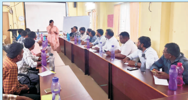
Training on Feed Management in Dairy Buffaloes