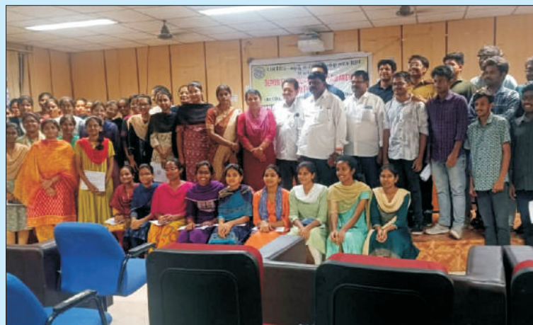
BVSc& AH Students Attending Workshop on Financial Literacy