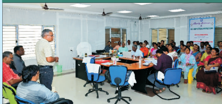
VCI team interacting with faculty of CVSc, Garividi

Veterinary Council of India (VCI) teams visited all the colleges of SVVU, interacted with the respective staff members and reviewed the facilities at the colleges for undergraduate studies from 14 th to 16 th May, 2025.