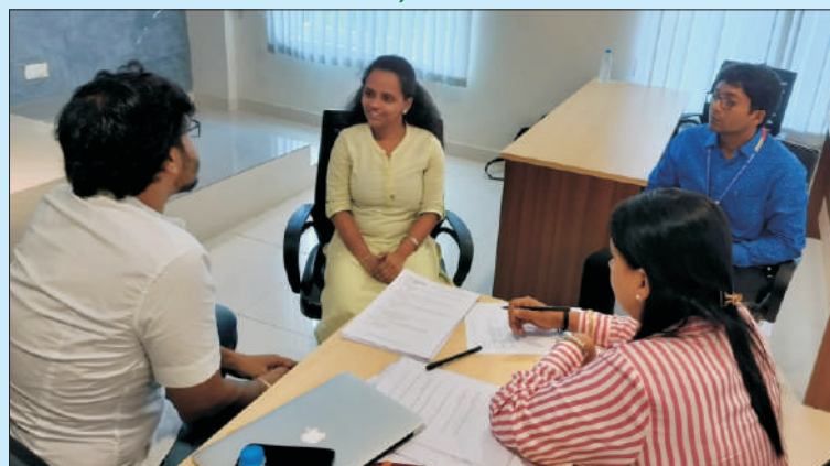
Students Attending an Interview for Campus Placement

A mega campus placement drive was conducted on behalf of the Placement cell, CVSc, Tirupati from 26 th to 30 th April, 2025. Under the supervision of Dr. K. Sudheer, Officer in-charge, Placement cell, campus placements were conducted for about 135 job vacancies in different pet clinics, dairy industries, poultry industries and ambulatory clinic services, etc. A total of 80 graduates of present and past alumni of SVVU have participated in the interviews. A total of 65 graduates got placement in different organisations.