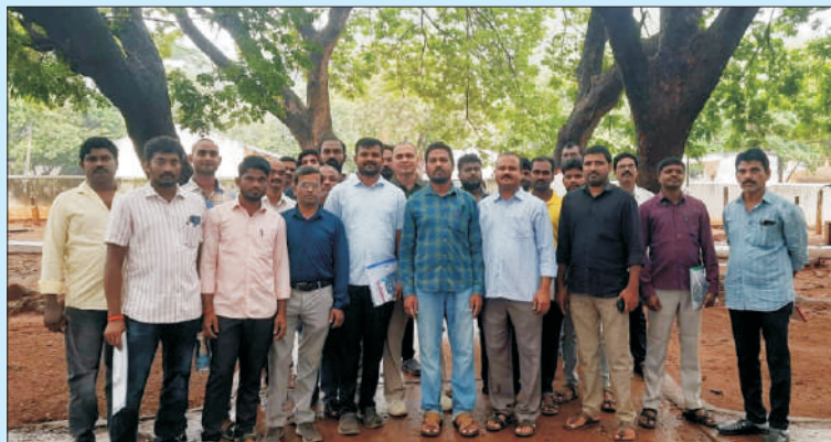
Sheep and Goat Entrepreneurs at LRS, Garividi