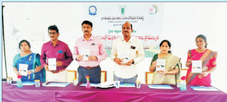
Release of Literature during the Training Programme

The Dept. of Animal Nutrition, CVSc, Proddatur in collaboration with ICAR-National Meat Research Institute, Hyderabad organized a one-day training programme on “Jeevala Pempakam lo melakuvalu- Khanija lavanaala Pramukhyata” for ST farmers on 18.06.2025 and “Pasuvulaku Misrama daanaa tayari vupayogaalu” for SC farmers on 30.06.2025. 30 farmers from 5 mandals participated in the programme.