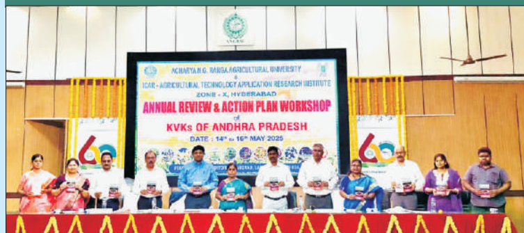
Release of Literature at Annual Zonal Workshop