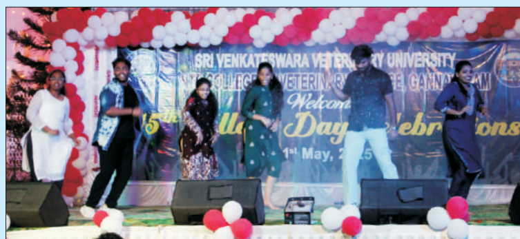
Cultural Programme by Students of NTR CVSc, Gannavaram