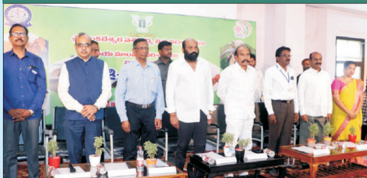
Inaugural ceremony of Farmer's Fair