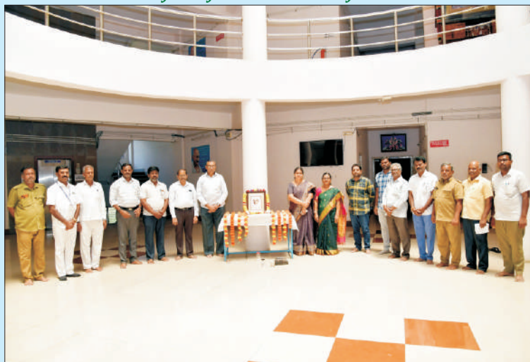
Babu Jagjivan Ram's Birth Celebration at University's Administrative Office

Babu Jagjivan Ram's birth anniversary (Samata Diwas) was celebrated on 05 th April, 2025 at all institutes of SVVU to honor the legacy of Babu Jagjivan Ram, a prominent Indian freedom fighter and social reformer known for his dedication to social justice and equality for the underprivileged sections of society.