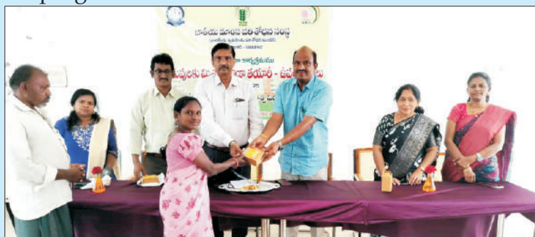
Input Distribution to the Farmers

The Dept. of Animal Nutrition, CVSc, Proddatur in collaboration with ICAR-National Meat Research Institute, Hyderabad organized a one-day training programme on “Jeevala Pempakam lo melakuvalu- Khanija lavanaala Pramukhyata” for ST farmers on 18.06.2025 and “Pasuvulaku Misrama daanaa tayari vupayogaalu” for SC farmers on 30.06.2025. 30 farmers from 5 mandals participated in the programme.