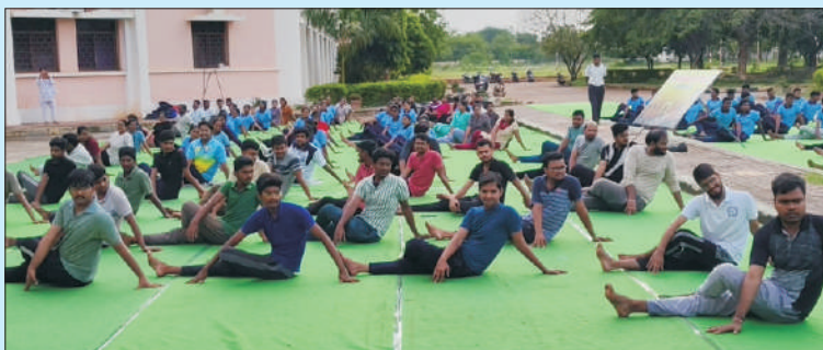
Yoga Day Celebrations at NTR CVSc, Gannavaram