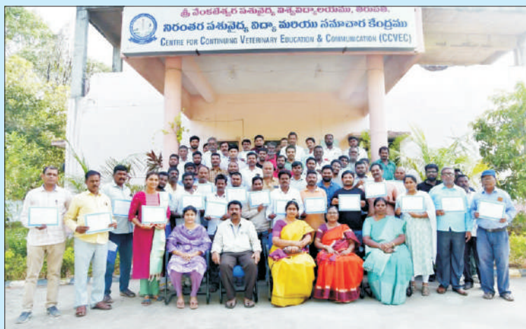
Participants of the Training Programme