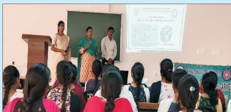
Lecture on the Importance of Water Conservation

A general awareness lecture was held for NSS volunteers on 17.05.2025, to highlight the importance of proper water utilization, methods to prevent water wastage and effective management tools for rainwater harvesting. Under the guidance of NSS officers, the students undertook the task of cleaning the water catchment areas of the administrative building.