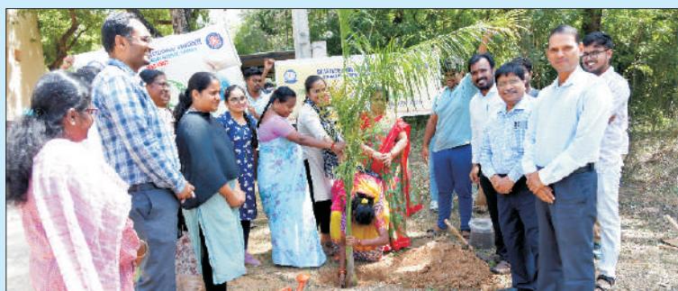
Tree Plantation by Students with their Mothers at CVSc, Tirupati