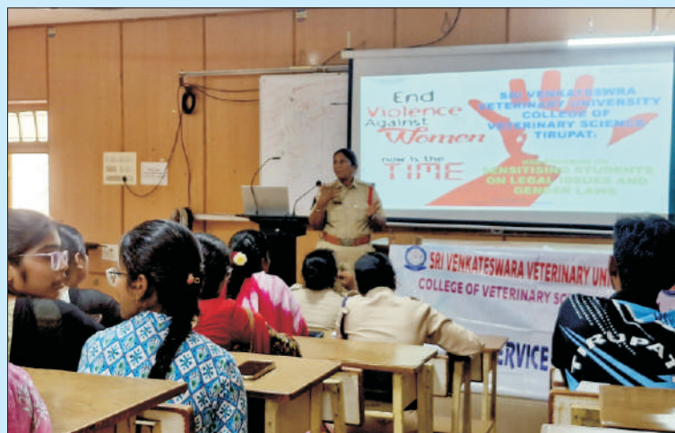
AP Police are Creating Awareness about Students

A special awareness session for students of CVSc, Tirupati was conducted on 31.05.2025 by the invited Disha-A.P. Police team, Tirupati, to educate students on aspects like cybercrime, cyber-bullying, digital arrest, the Sakthi app (for distress calls) and essential online safety protocols. The Shakti app was downloaded by all the participating girl students.